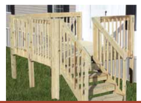
Basic 8 x 8 Deck